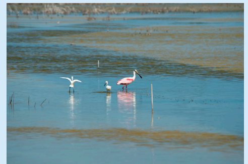
The Everglades Mitigation Bank is home to thousands of native flora and fauna.

For more information, visit: www.fpl.com/evergladesmitigation