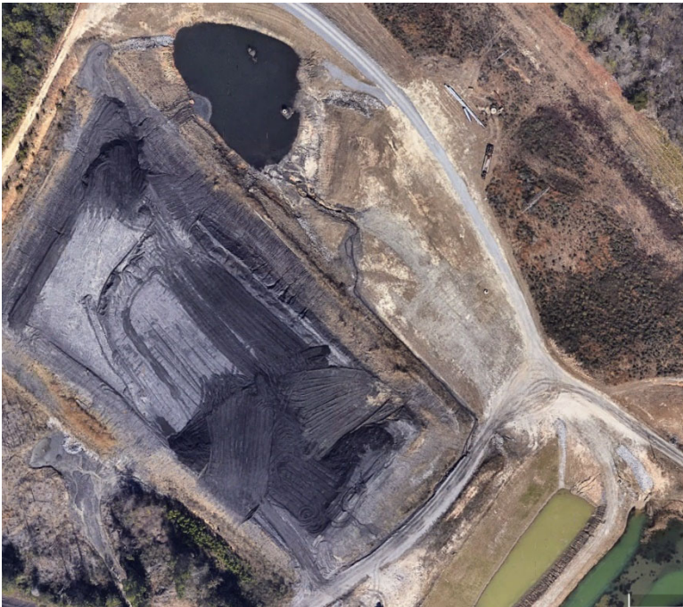
Figure 1: Aerial Photograph

Since the past annual inspection, there were no observed changes in the geometry of the landfill.